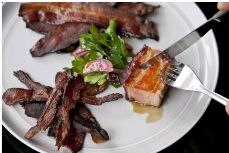
BeSpoke Kitchen's Bacon Sampler.

Chef Franco Barrio launched BeSpoke Kitchen in the West Village last September. Business has been so good that the the chef, formerly behind Casa Mono and Picholine, has opened his West Village eatery for brunch earlier this month using ingredients sourced from within 15 miles of his kitchen. One major highlight is the slew of house-cured meats, which find their way to your table in a number of forms including a to-die-for bacon sampler. Luckily, it also sits just far away enough from the bottomless party brunches in the Meatpacking District, allowing for a more serene weekend dining experience.